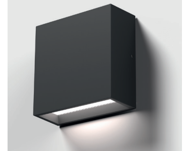
Shown in Ferrite Grey Finish