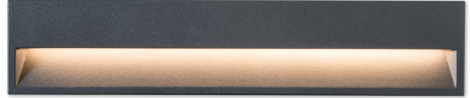
Shown in Ferrite Grey Finish

Designed in collaboration with Gensler as Product Design Consultant